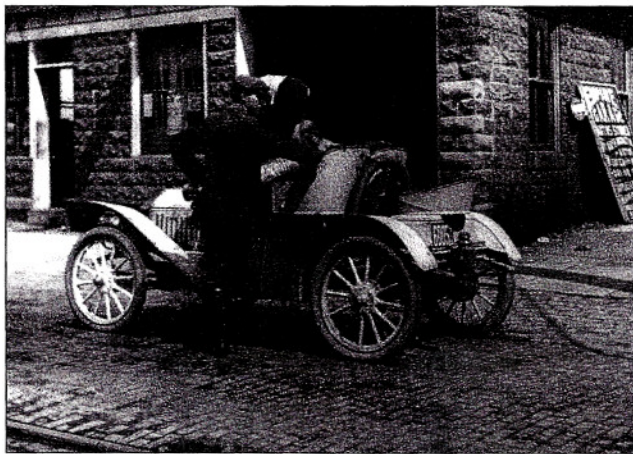
A 1909 photo showing a man putting gasoline in his Buick roadster.

Lacking property and schooling, many former slaves accepted tenant and sharecropping arrangements that kept them in debt and poor. Yet these arrangements also did give them some freedom to make contracts, to move and work for other land owners, to form stable families, etc. Reconstruction was a failure in the short run. The civil rights laws and amendments went unenforced for a long time, it is true. Yet blacks did begin in these years to build up the institutional supports (churches, black colleges, businesses, political organizations) to fight effectively for full equality. It was tragic that this took so long to do. Yet through this long struggle, African Americans really did create a solid basis for their equal place in American society. It was in these years that they laid the foundation for that great triumph to come.